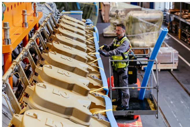
A thousand components bear a logo—here, the cylinder head covers of the first engine featuring the new brand in Augsburg.