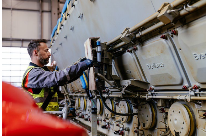
The 20V32/44CR with Everllence branding pictured during packing at the heavy-load center at the Augsburg site