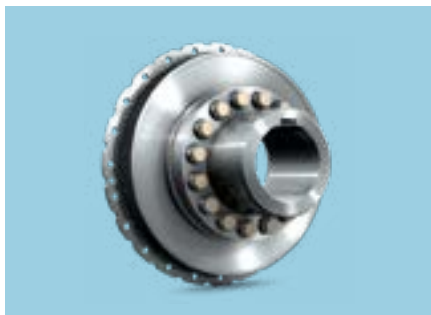
1 row of rubber element

GSS1; GSF1; LFS1 Coupling with 1 row of the rubber element GSS2; GSF2; LFS2 coupling with 2 rows of rubber element GSS3; GSF3; LFS3 coupling with 3 rows of the rubber element