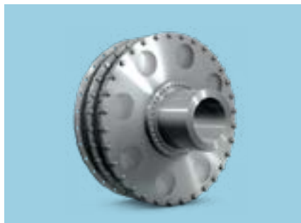
2 rows of rubber element